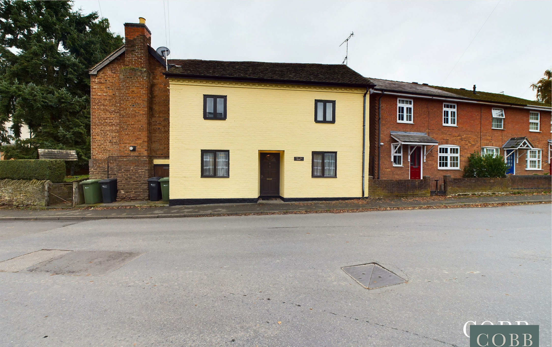
The Old Shop, 5, Ryelands Road, Leominster, HR6 8NZ Price £139,950